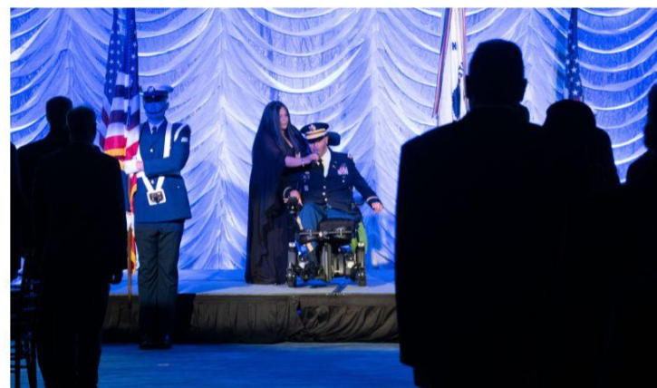
Table and ticket purchases include access to the Cocktail Reception, a formal, 3-course chef-driven dinner and program, and the dessert reception.